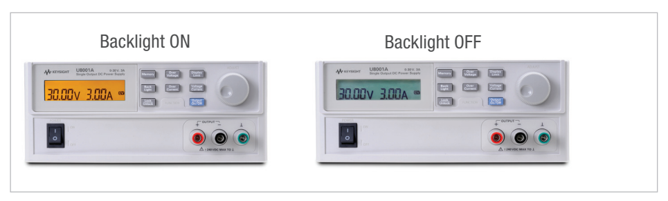
Figure 2. Backlight on/off options for LCD display