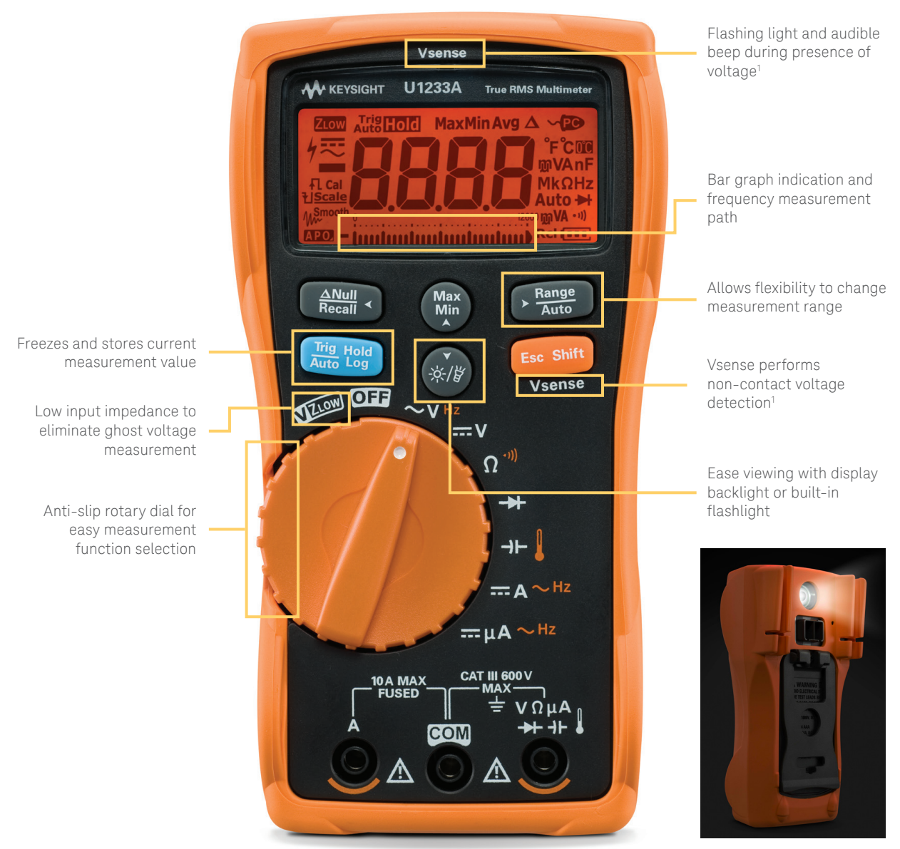
Figure 1. U1230 Series front view