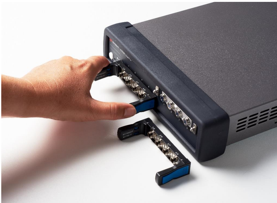
Figure 2: N7745C with N7740FI FC/PC quad-adapter

A bare fiber version of the quad-adapter, N7740BI, can host up to four bare fiber holders. Two types of bare fiber holder kits with four holders each are available for fiber diameters up to 400 \mu\text{m} (81004BM) and between 400 \mu\text{m} and 900 \mu\text{m} (81009BM). The one-click zeroing adapter N7740ZI allows quick and reliable 4-port zeroing of the power meters.