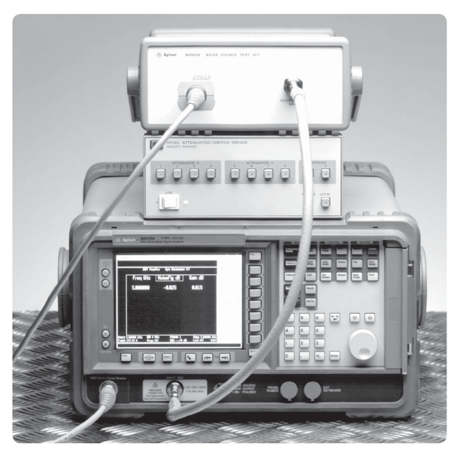
Figure 1. Noise source test system that includes the N2002A noise source test set, N8975A NFA and 11713A attenuator/switch unit

Note: The N2002A noise source test set must be used within a noise source calibration system; the N2002 has no power supply and performs no measurements.