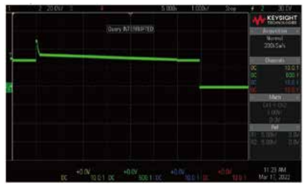
LDC302 28V abnormal voltage transients (overvoltage)