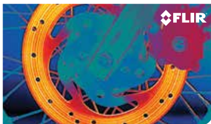
Motorcycle brake testing